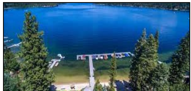
Payette Lake in McCall

weekend. If you only need the one night, you can get a discount at a hotel booking site like Priceline or Booking.com. If you want to stay at the Holiday Inn Express for the entire weekend, it will be cheaper to use the block rate, so call: (208) 634-4700 NOW!!!! Other Lodging: There are lots of lodging options in McCall and New Meadows: AirBnB, cabins, and other hotels, so use the Internet to find out what will work for your family. Please reserve your lodging now because rooms go very quickly in the summer!